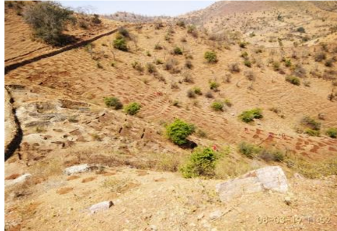
Soil & water conservation measures and pit digging works completed in Patiya II common pastureland (Badgaon block)