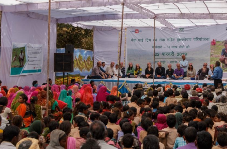
Unveiling project foundation stone in Patiya village