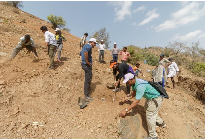
Plantation and installation of pitcher irrigation system /Ged system by MakeMyTrip Team